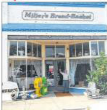
Blackville, located along the SC Heritage Corridor, is home to a small Mennonite community. One of its families runs Miller's Bread Basket, a popular restaurant on Main Street.