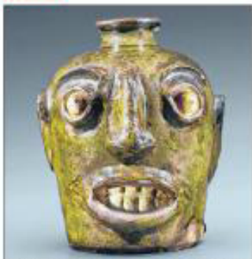
"Face jug" is a term coined by art historians to refer to an African American pottery piece created in the second half of the nineteenth century, in the midst of slavery, in the Edgefield District of South Carolina.