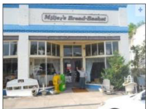
Blackville, located along the South Carolina National Heritage Corridor, is home to a small Mennonite community. One of its families runs ... Read More

The four counties of Aiken, Allendale, Bamberg and Barnwell make up the 2,462 square miles of Thoroughbred Country in western South Carolina. The area is situated along I-20 between Atlanta and Columbia, S.C., and just east of Augusta. Leave the interstate behind to explore charming small towns and their galleries, antique shops, roadside produce stands, festivals, plantation homes and historical sites from Colonial and Civil War times.