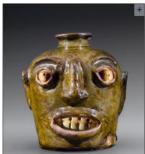
Face jug, is a term coined by art historians to refer to an African-American pottery type created in the second half ... Read More

Experience: Visit the Healing Springs Country Store for deli sandwiches, hot dogs, hoop cheese, baked goods, ice cream, and Pennsylvania Birch Beer (carbonated soft drink) and local souse (pickled head cheese). The store sells sterilized gallon jugs for less than $2 to take to the artisan wells of Healing Springs around the corner. 2563 Healing