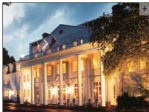
Famous guests of the Willcox included Winston Churchill, Harold Vanderbilt, Elizabeth Arden and Count Bernadotte of Sweden. This grand hotel is ... Read More

Stay: Reserve a Barnwell State Park cabin or campsite and get savings on up to four park activities. Two-bedroom cabin rates average $66 per night. The 307-acre park is known for its fishing (on a 16-acre or an 8-acre lake) and nature trails. 223 State Park Road, Blackville, 803-284-2212.